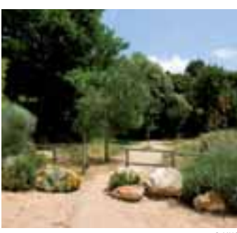
Font del Camp