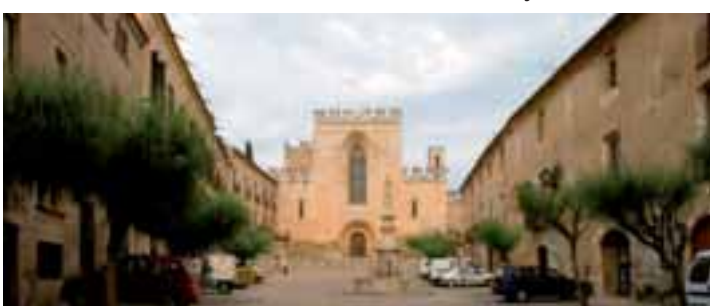
Plaça Sant Bernat, with the church behind

Beside the chapel there is a barred way that leads onto a private estate on which the Molí de Dalt, or Upper Mill, once stood. A notable feature of the square is the Porta de l'Assumpta, or Assumption Gateway, a monumental Baroque construction framed by two columns topped by a niche containing a portrayal of the Assumption of Mary, patron saint of the Cistercians. Above this can be seen the abbey's device, the double cross. If you look out over the parapet you can enjoy a magnificent view of the Gaià valley and the Albereda.