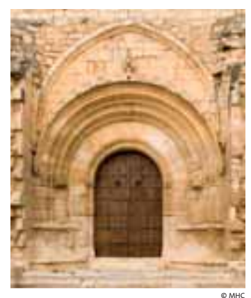
The Royal Gate