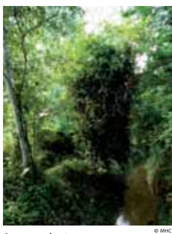
Greenery and water

On reaching Santes Creus again, you will find some paths on the left that descend into the Albereda, or poplar wood. It covers an area of about 9 hectares on the left bank of the river Gaià.