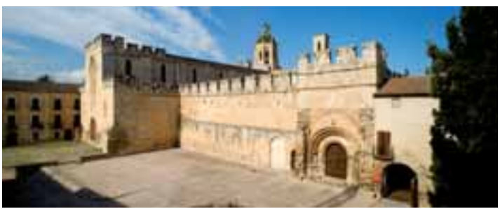
Joc de Pilota