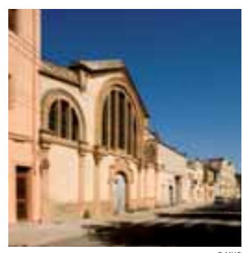
Agricultural cooperative by Cèsar Martinell